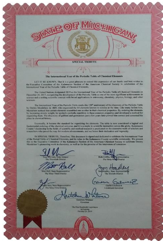
Special Tribute Certificate to the Kalamazoo American Chemical Society, in recognition of celebrating IYPT