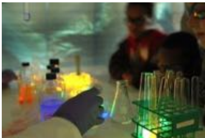
A demo at the 2015 Chemistry Day

I love the end of summer here in Kalamazoo. The weather has not yet turned, the gardens and orchards are full of good eats, and Chemistry Day at the Kalamazoo Valley Museum is just around the corner! The Chemistry event is a personal favorite of mine. I really enjoy the opportunity to share some science with the scores of families that come downtown to join us at the Museum for this event. So, please mark your calendars: October 8 th , noon to 4 pm. If you have the time, please come volunteer with us – we have plenty of ideas for experiments if you are looking for inspiration. If you can't volunteer, grab the kids, grandkids, or neighbor's kids, and come down to enjoy the demonstrations and activities on hand. I hear there may even be a mystery to solve! This year is our 30 th year co-hosting this event with the Kalamazoo Valley Museum. It is a real gem, and I hope to see you there.