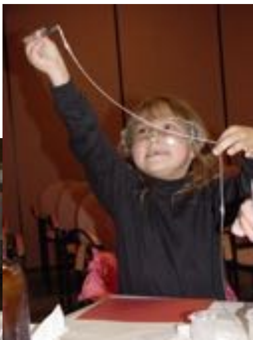
Kalamazoo youth having fun with hands-on learning at a past Chemistry Day!