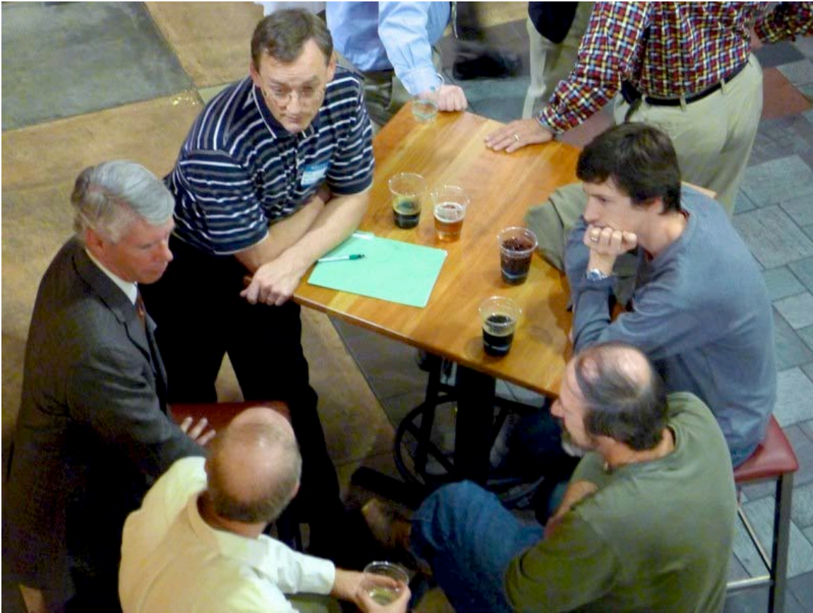
Lively discussions following formalities.