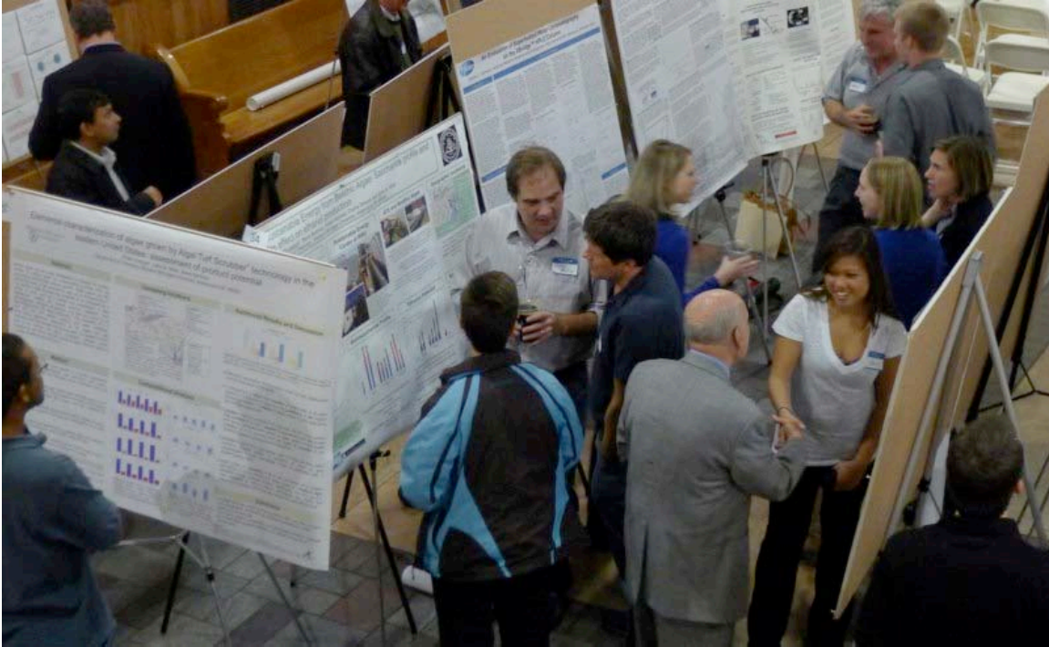
Over 45 posters were on display